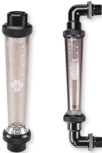
Shown with optional polysulfone fittings