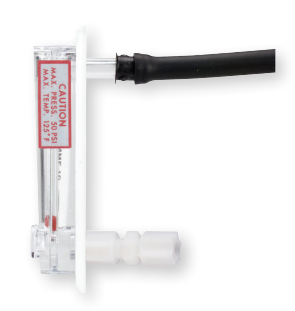
Model MMF connections. Connector at top, installed in panel, has retainer and flexible tubing in place. Connector at bottom shows alternative connection with metal or rigid plastic tubing, using a double compression nylon tube union (as Dwyer Part No. A-328).