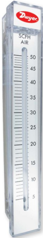
Model RMC 10" scale, 15-3/8" high